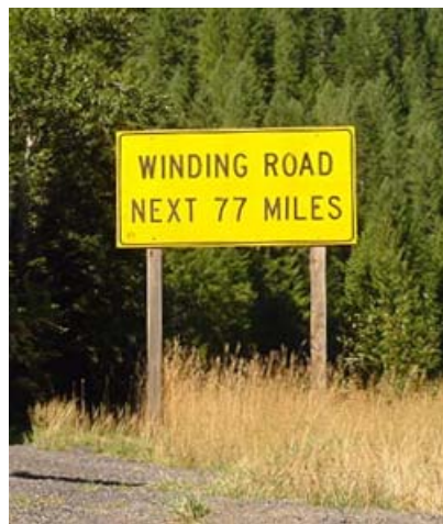
How to find the best motorcycling roads in Washington.

It's reasonable to wonder what these books contain that their absence can put a black cloud over an entire state.