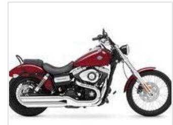
2010 Harley-Davidson Preview